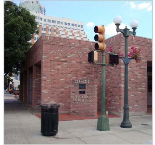
Sign Monument Facing the Corner of Dolorosa and South Santa Rosa