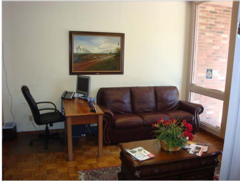
Reception area with parquet flooring