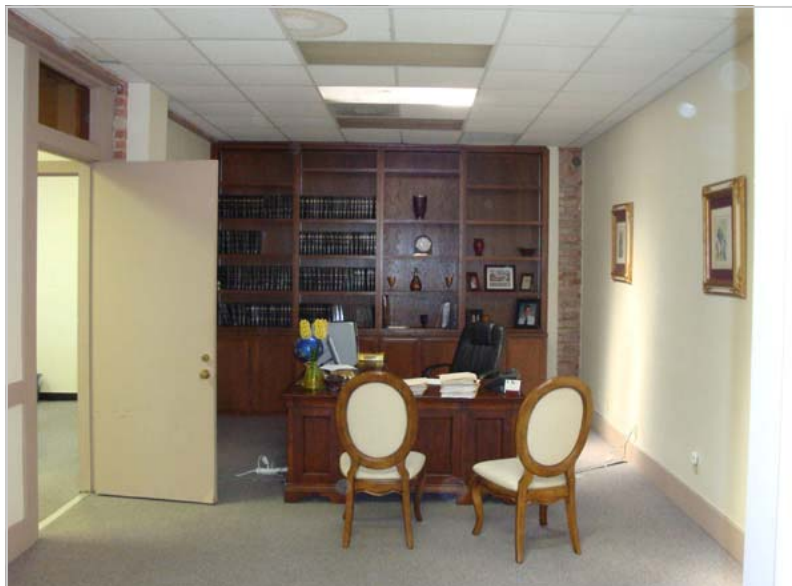
One of three offices in the space