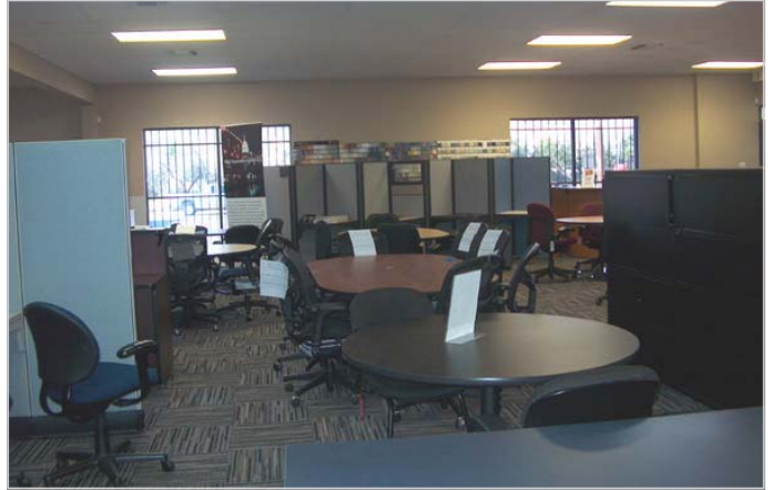
View of 2,500 SF Addition to Showroom