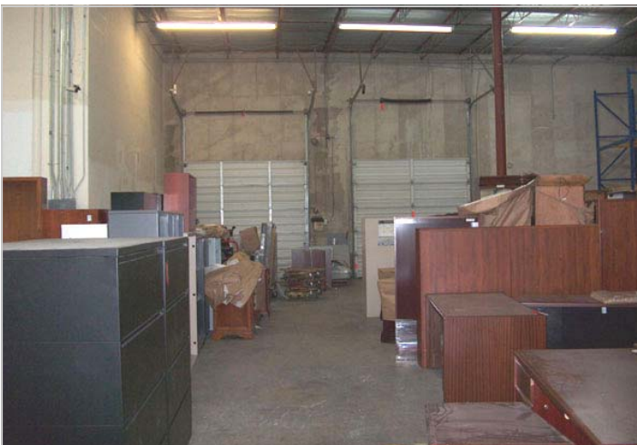
View of Warehouse Looking at Dock-High and Ramped Overhead Doors