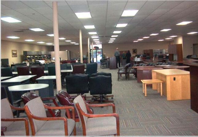
View of Showroom Looking at Front Door and Loop 410