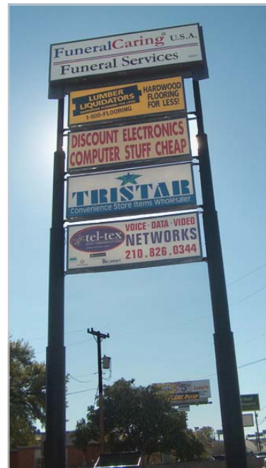
Two Slots on Pylon Sign Available